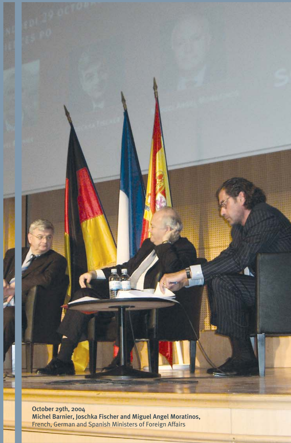
October 29th, 2004 Michel Barnier, Joschka Fischer and Miguel Angel Moratinos, French, German and Spanish Ministers of Foreign Affairs